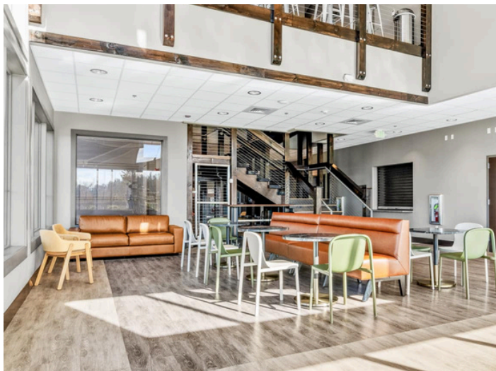
Student Center Gathering Area