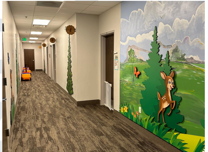
Campus Staff Pods