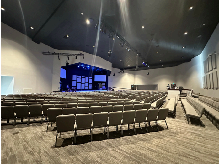
Main Worship Center